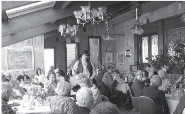
Above, Museum Association members enjoy the historical program at the winter luncheon. Below, Fort Caspar Chautauqua is one of the educational programs sponsored by the Fort Caspar Museum Association.

FCMA is a 501(c)(3) non-profit organization that supports preservation and education activities at Fort Caspar Museum through financial support and volunteer time.